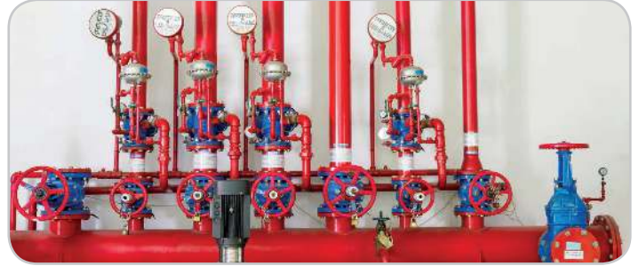
The weekly, quarterly and annual flow testing of fire sprinkler systems is one of the many areas we can assist you

PME has been active in Papua New Guinea since 1968 and has consistently delivered projects using our values and vision to achieve success for our clients. Papua New Guinea is our home and we concentrate our business in country and aim to offer a diverse range of services delivered by experienced personnel who have proven experience and understand the logistical complexities of achieving project success in PNG. Our onsite staff are supported by a resident management team with over 60 years of experience working in and around Papua New Guinea who are available to assist onsite at all times. Our philosophy has always been to train the next generation of industry leaders, we achieve this result by following a training plan that allows domestic workers access to their foreign counterparts allowing knowledge and experience transition. In doing this we believe we are a socially responsible company committed to helping Papua New Guineans achieve their aims and goals.