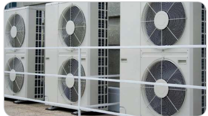
From small to large installations, our service technicians will assist you in complying with your service requirements

PME is committed to the environment and strives to continually improve all our operations. We strive to protect the environment by minimizing waste within our control and following best management practices and procedures and are constantly being reviewed.